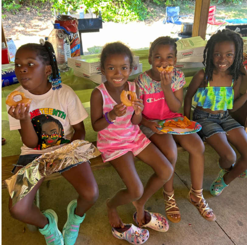
Future GHLST BOARD MEMBERS

OUR PAST, PRESENT AND FUTURE! WE ARE JOY!